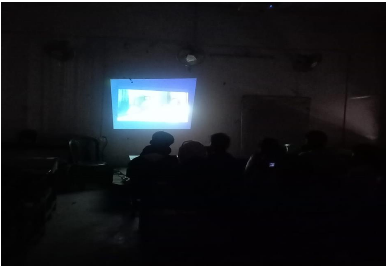
A film Being screened by Film Club

The Film Club, Ananda Chandra College was started as part of the Department of English's multimedia teaching-learning innovations. What began as a series of screenings of film adaptations of books included in the NBU CBCS English Syllabus, gradually metamorphosed into a film club where students from other departments also joined in to watch and discuss. These are generally held after 3:30pm on Saturdays, so that no class timing is disrupted and maximum students can watch the classics of world cinema.