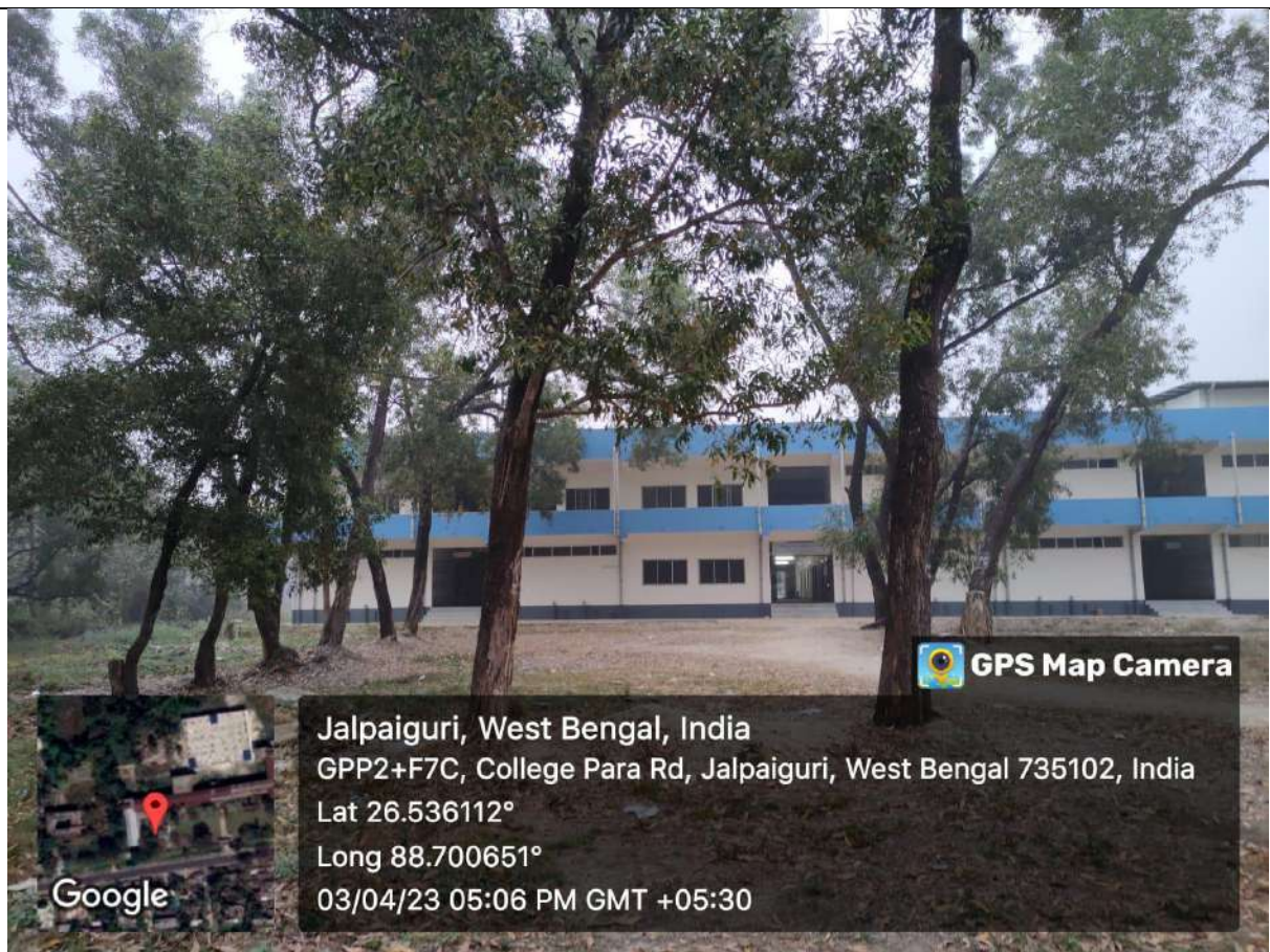
BESIDE SCIENCE BUILDING