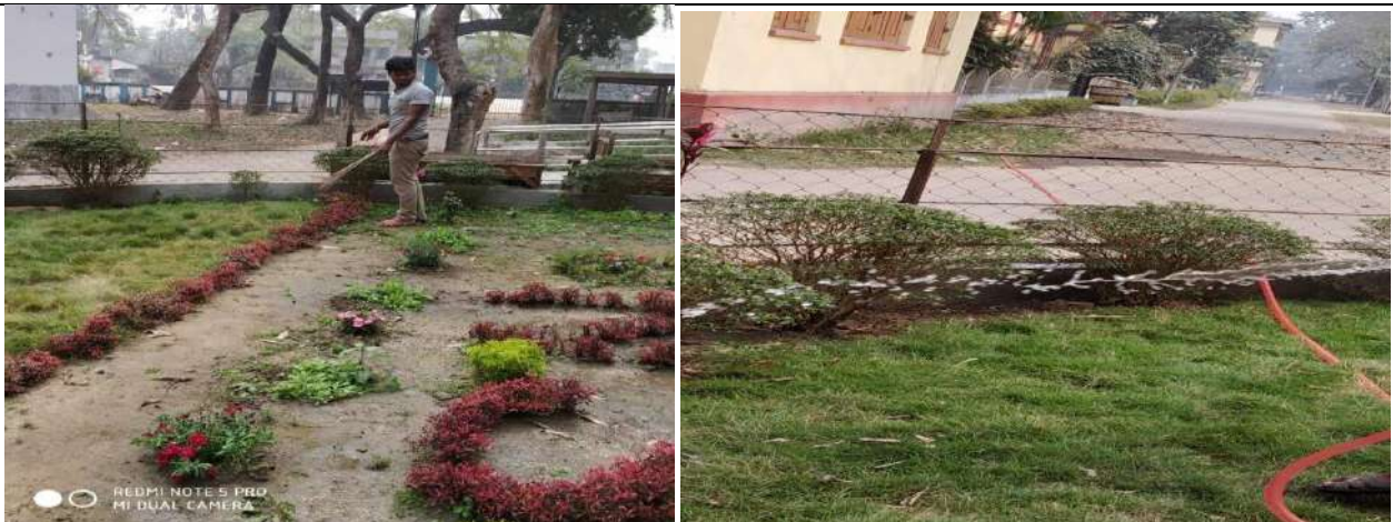
Fencing and beautification of flower garden at college