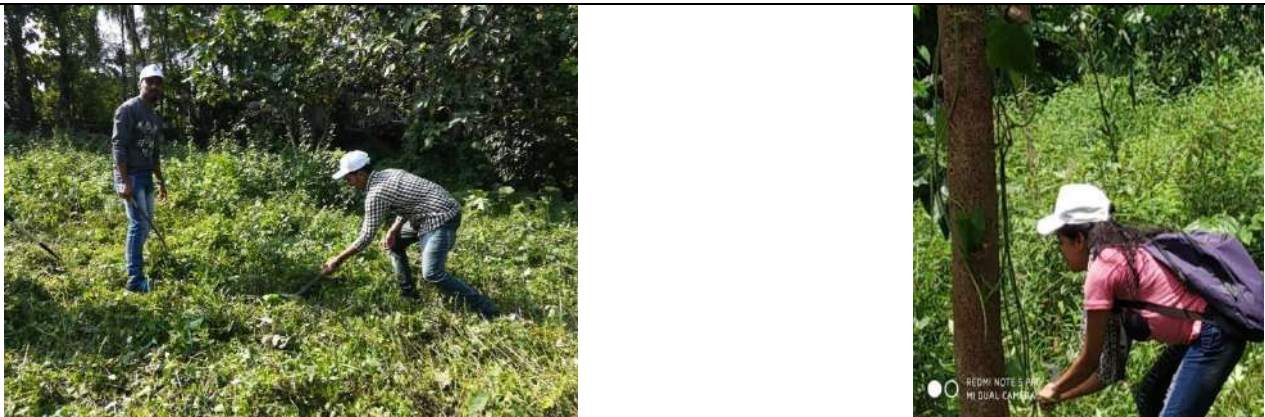
Cleaning of college campus

(04.02.19 TO 06.02.2019 & 01.03.2019 TO 15.03.2019)