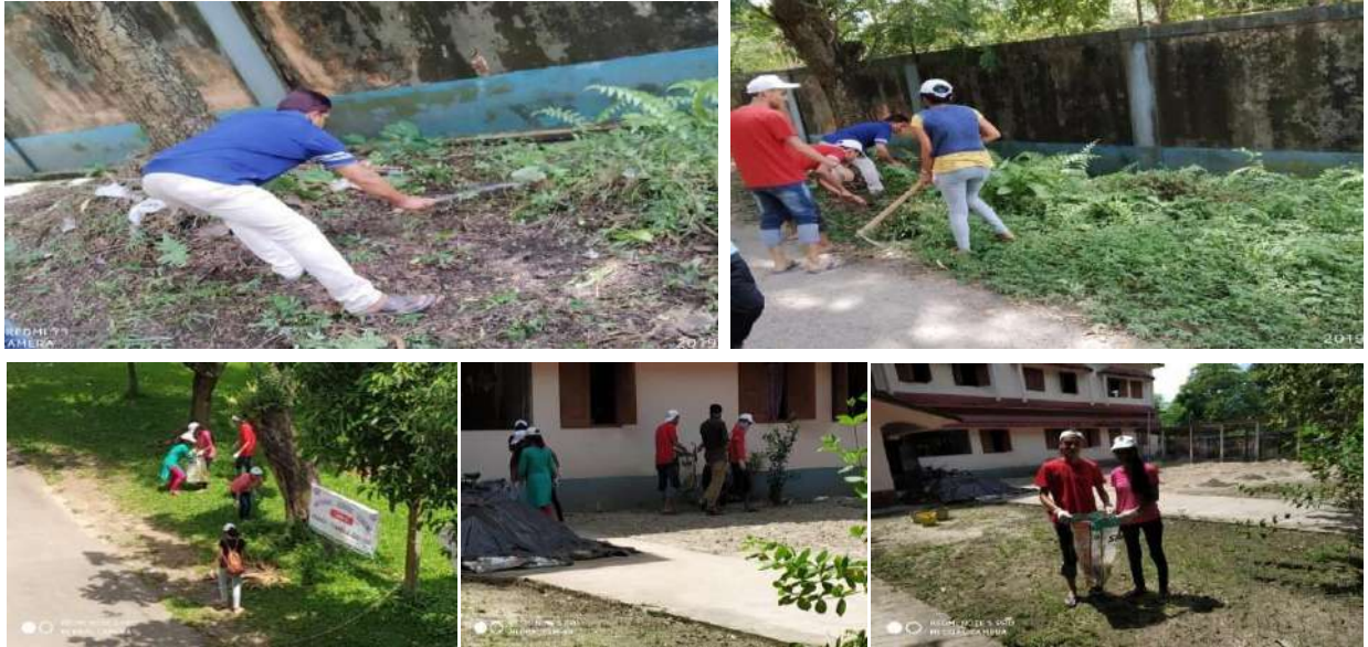
Cleaning drive of the college on 07.01.2019 to 10.01.2019