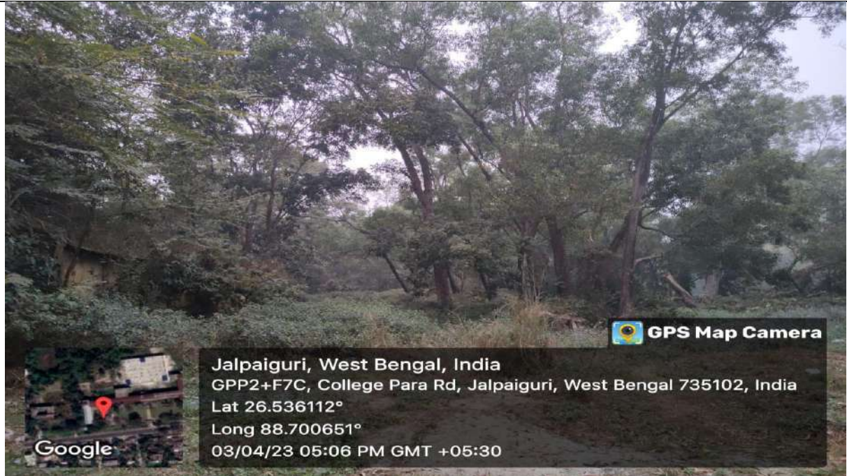
FOREST AREA IN THE COLLEGE PREMISE BEHIND COLLEGE MAIN BUILDING