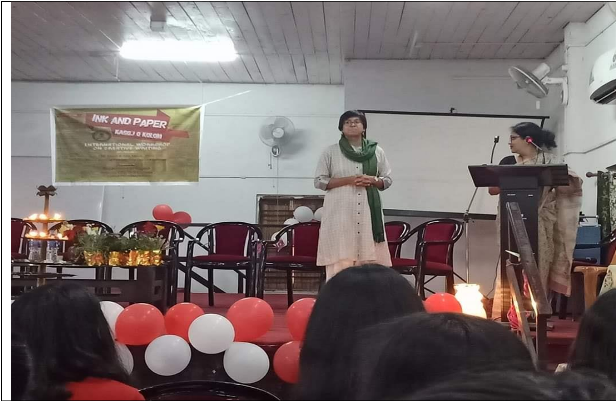
INTERNATIONAL WORKSHOP ON CREATIVE WRITING - Ink and Paper Kagoj O Kolom Date: 13.03.2020 and 14.03.2020