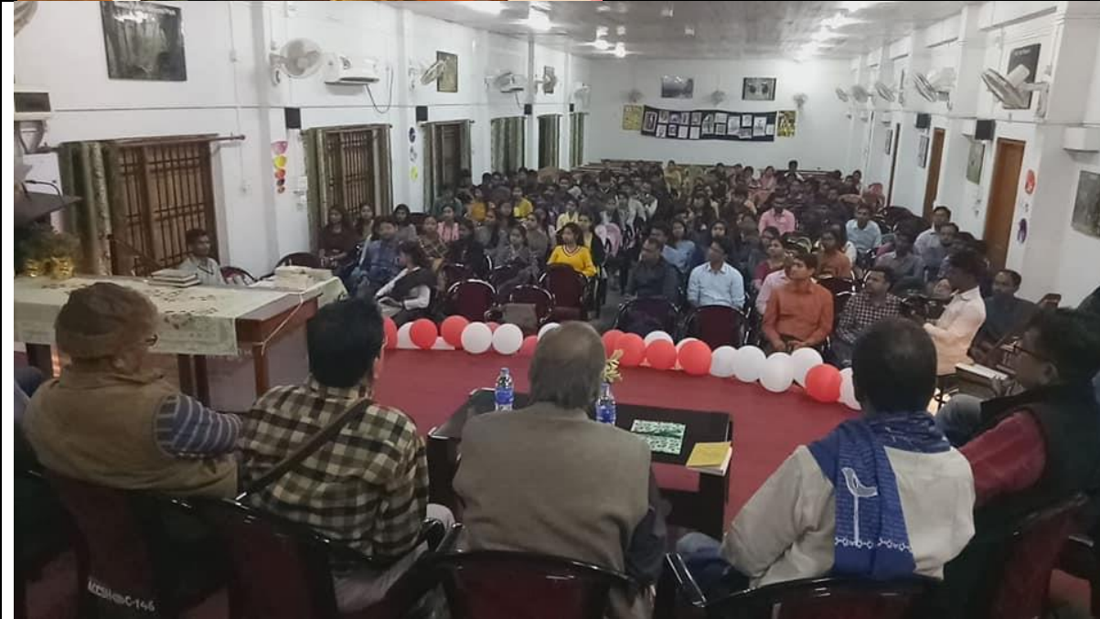
INTERNATIONAL WORKSHOP ON CREATIVE WRITING - Ink and Paper Kagoj O Kolom Date: 13.03.2020 and 14.03.2020