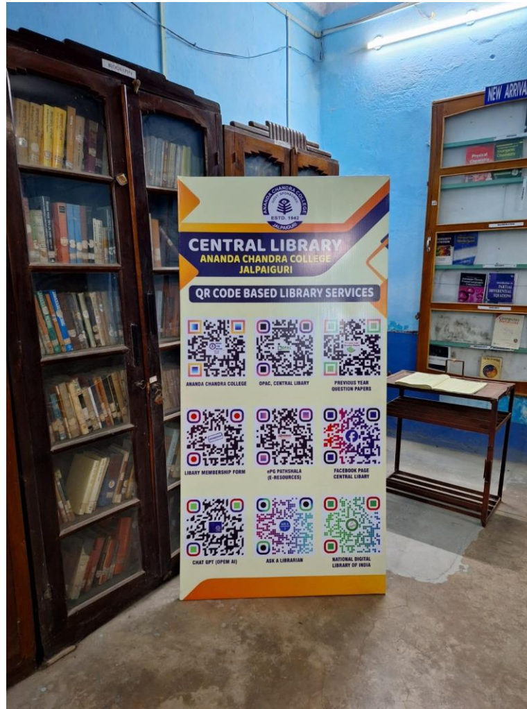
QR code for Previous Question Papers