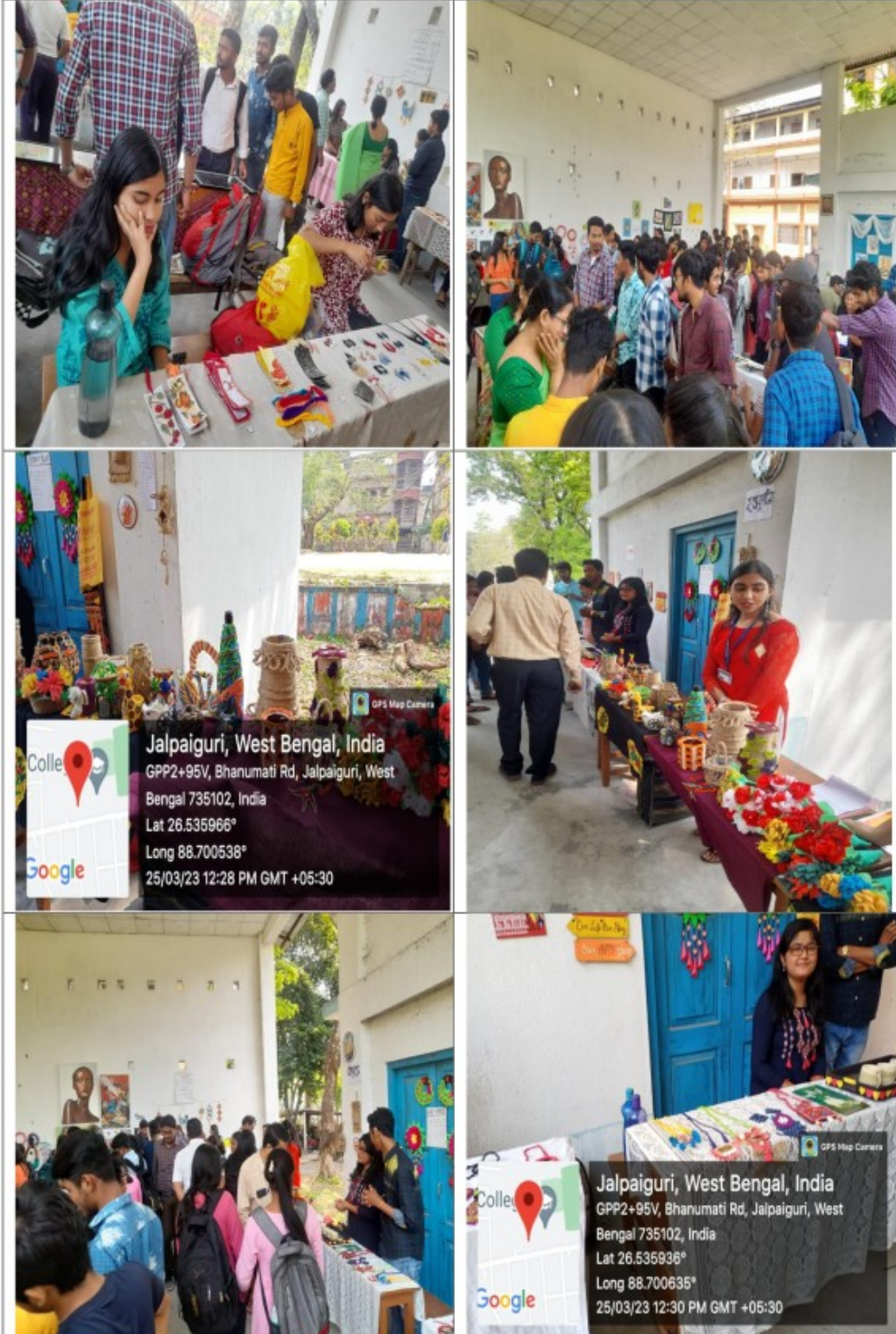
Anandamela - Exhibition cum sale of handcrafts by the students. Date: 25.03.2023

E-mail: accjal@gmail.com Website: www.accollege.in