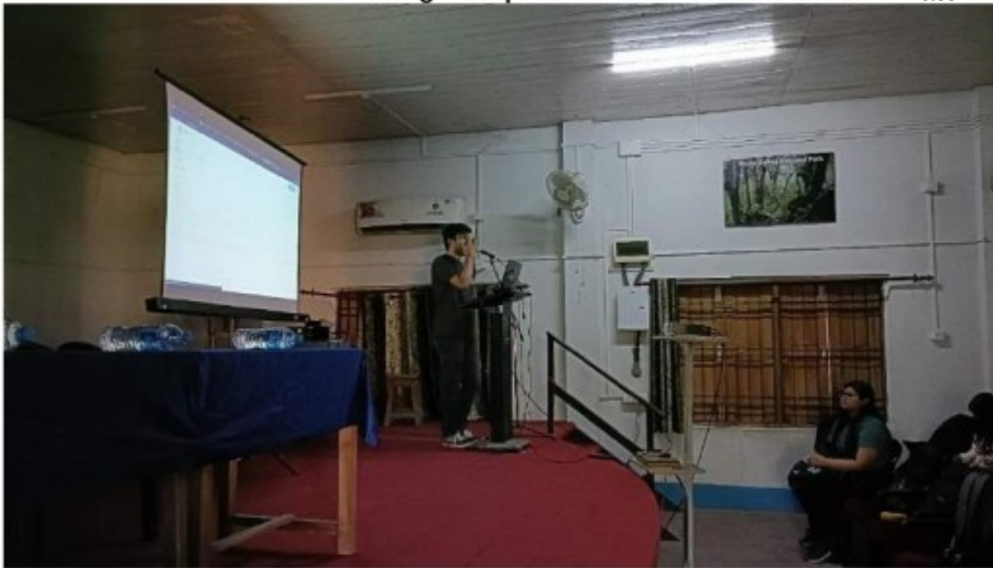
Into the Hands-on training session Date: 18.12.2021