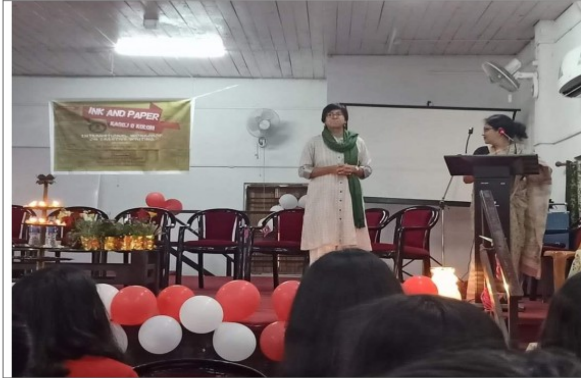
INTERNATIONAL WORKSHOP ON CREATIVE WRITING - Ink and Paper Kagoj O Kolom Date: 13.03.2020 and 14.03.2020

E-mail: accjal@gmail.com Website: www.accollege.in