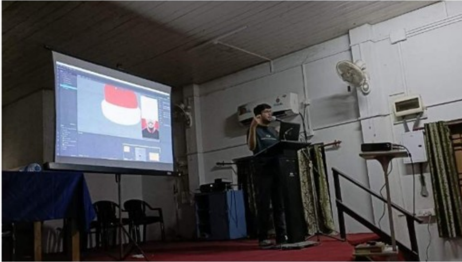
Introducing the Spark AR software to students Date: 18.12.2021