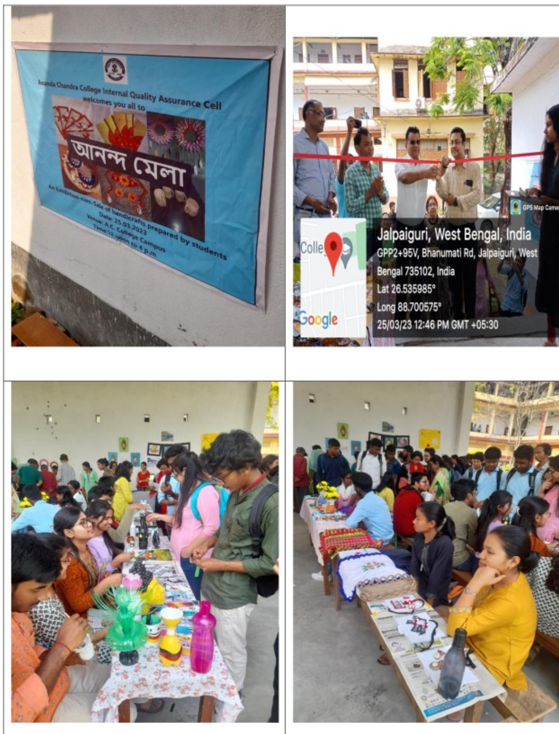
Anandamela – Exhibition cum sale of handicrafts by the students. Date: 25.03.2023