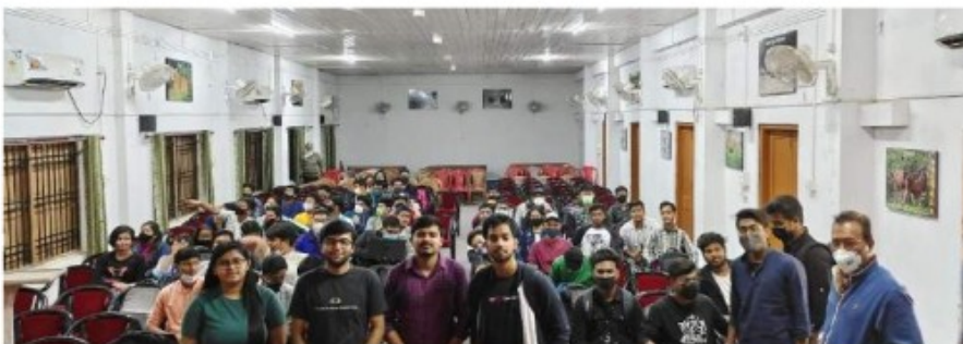
Group photo with the attendees Date: 18.12.2021