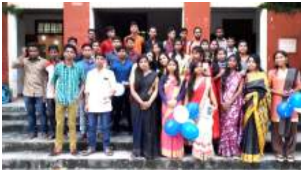
Fresher's (Dept. of Botany)