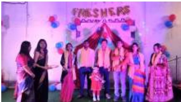
Fresher's (Dept. of Philosophy)