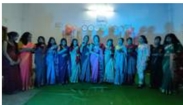
Dept. of Sanskrit