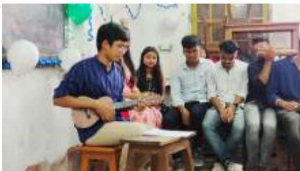
Farewell (Dept. of Botany)