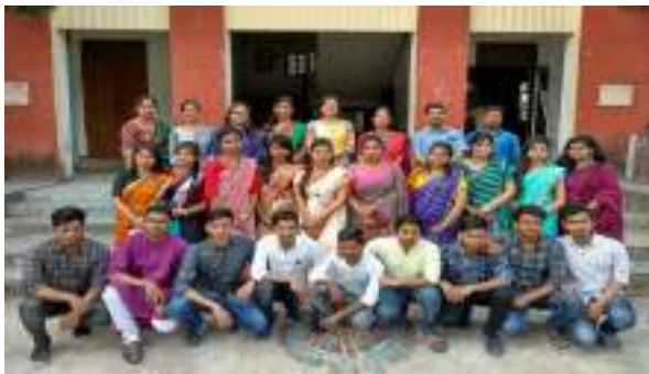
Farewell (Dept. of Botany)