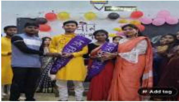
Fresher's (Dept. of Education)