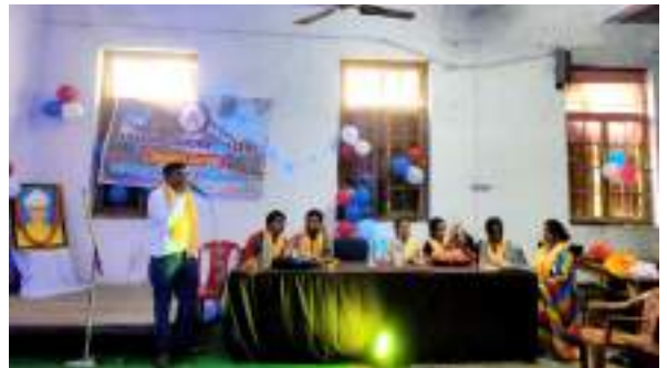
Fresher's (Dept. of Philosophy)