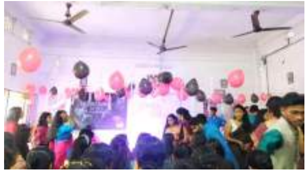
Fresher's (Dept. of English)