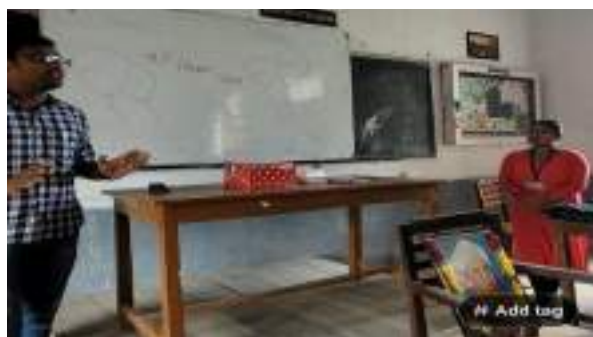
Dept. of Education