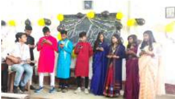
Fresher's (Dept. of Botany)