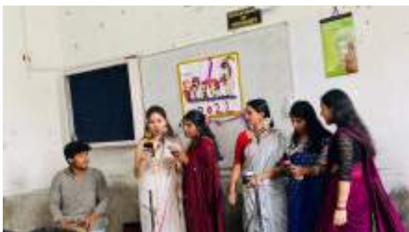
Farewell (Dept. of Sociology)