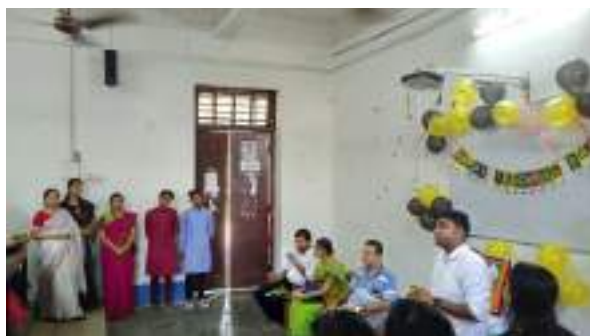
Dept. of Philosophy