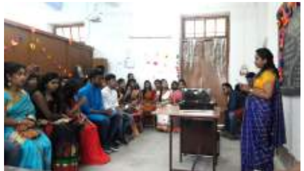
Farewell (Dept. of Botany)