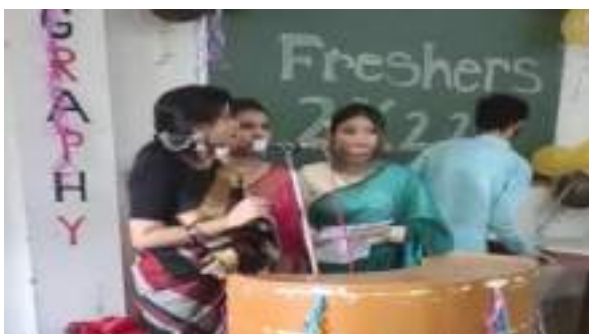
Fresher's (Dept. of Geography)