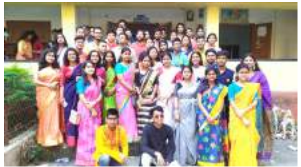
Fresher's (Dept. of English)