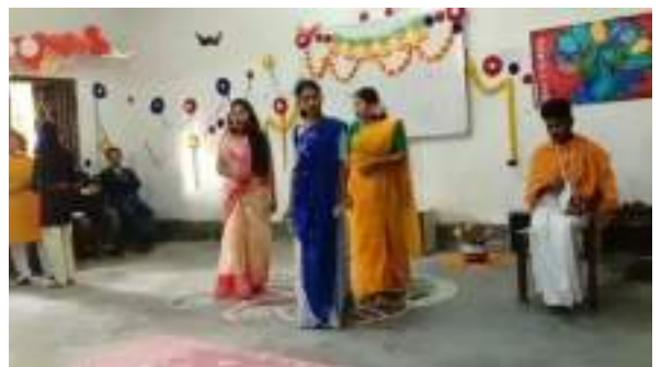
Fresher's (Dept. of Bengali)