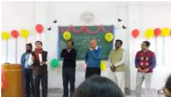
Farewell (Dept. of Geography)