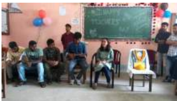
Dept. of Political Science