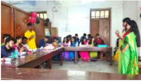
Farewell (Dept. of Botany)