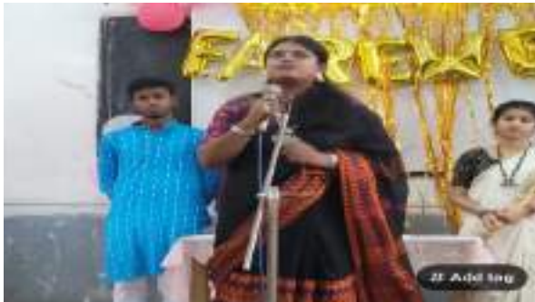
Farewell (Dept. of Education)