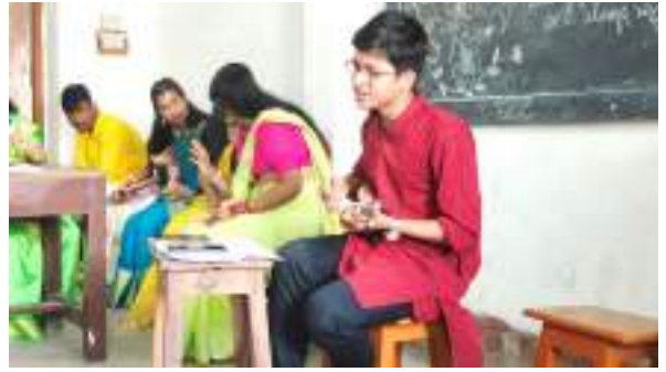
Farewell (Dept. of Botany)