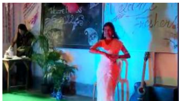
Fresher's (Dept. of English)