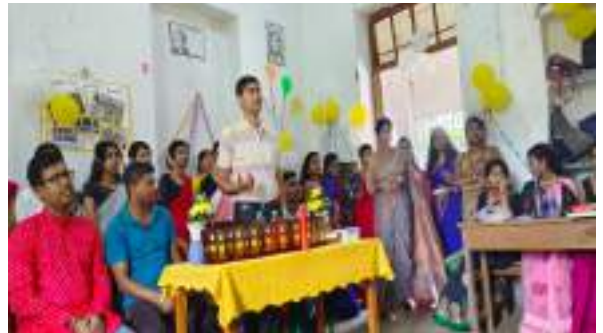
Farewell (Dept. of Education)