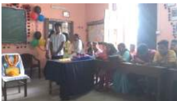
Dept. of Political Science