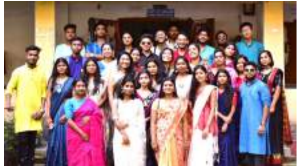
Farewell (Dept. of English)