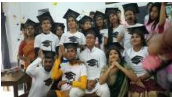
Farewell (Dept. of Education)