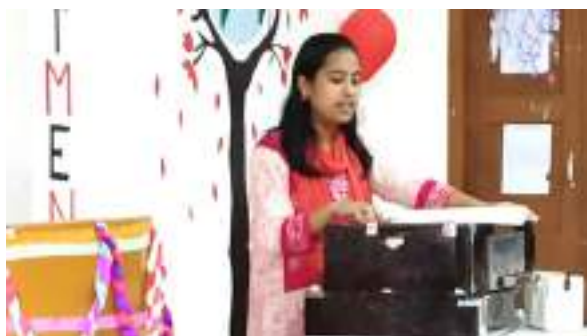
Dept. of Geography