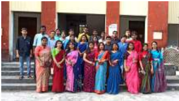
Fresher's (Dept. of Chemistry)