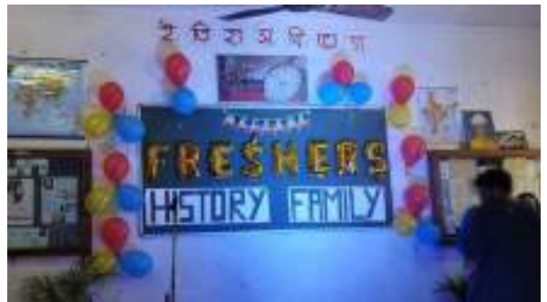
Fresher's (Dept. of History)