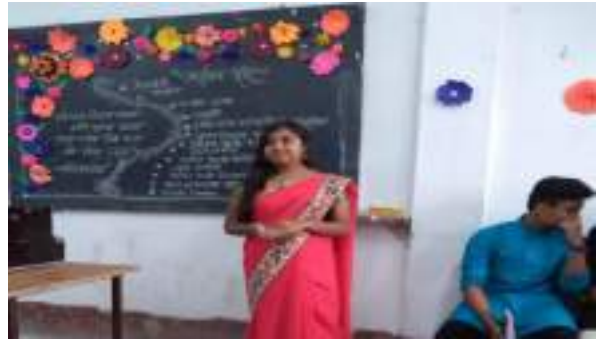
Farewell (Dept. of Botany)