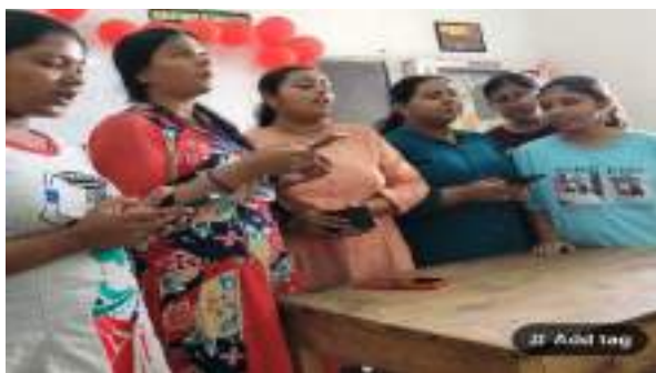
Dept. of Education