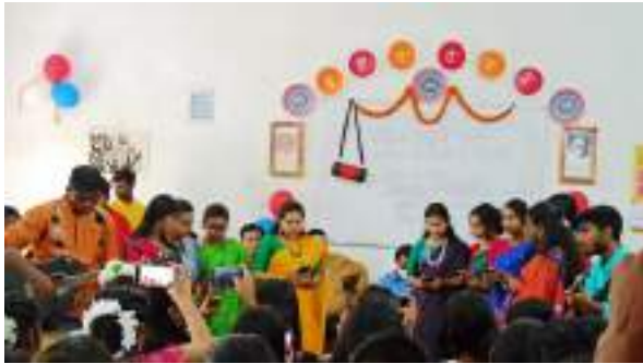
Fresher's (Dept. of Bengali)