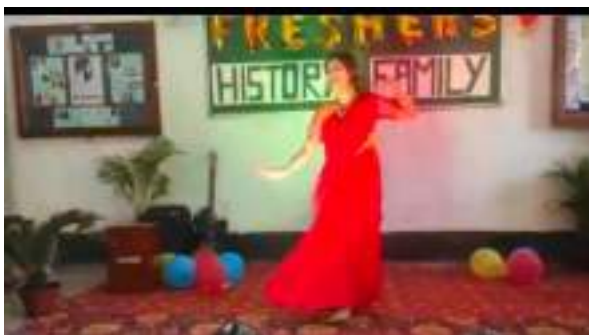
Fresher's (Dept. of History)