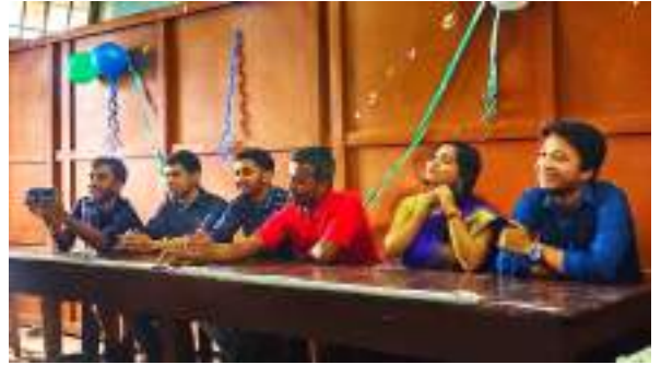
Farewell (Dept. of Botany)