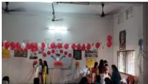
Dept. of Sanskrit