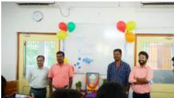
Dept. of Geography