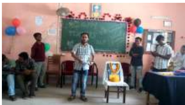
Dept. of Political Science