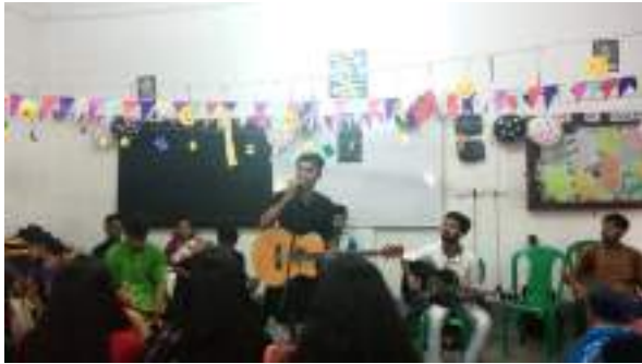
Fresher's (Dept. of English)