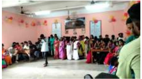
Fresher's (Dept. of Pol. Sci.)