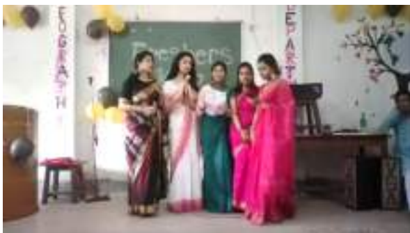
Fresher's (Dept. of Geography)