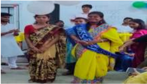
Fresher's (Dept. of Education)