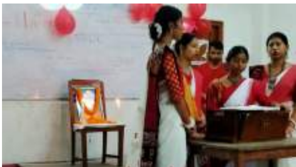
Dept. of Mathematics