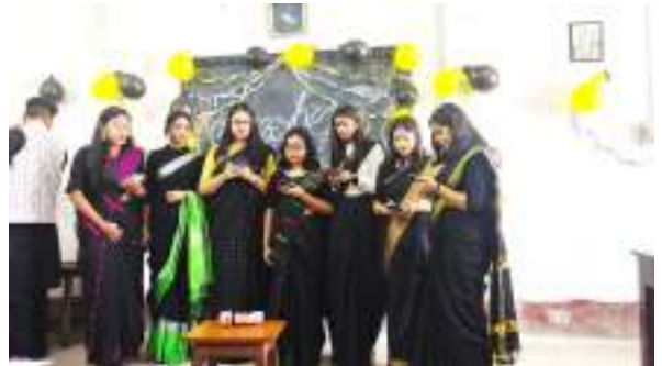
Fresher's (Dept. of Botany)