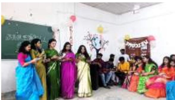
Farewell (Dept. of Geography)