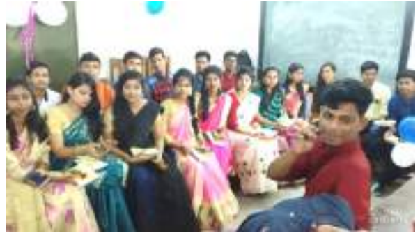
Fresher's (Dept. of Botany)