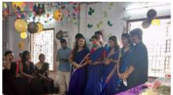
Fresher's (Dept. of Microbiology)