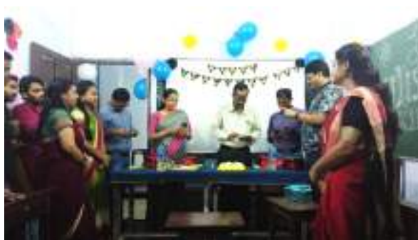
Dept. of Chemistry