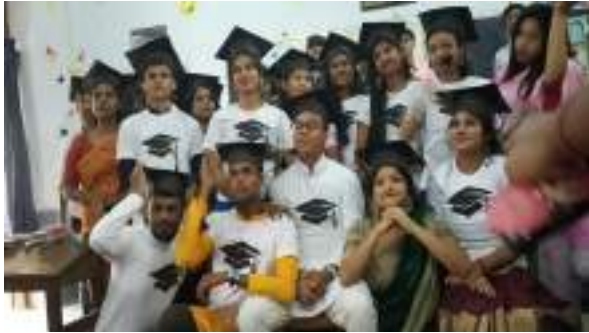
Farewell (Dept. of Education)