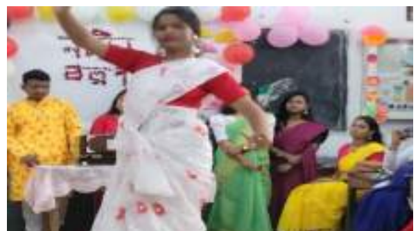
Fresher's (Dept. of Education)