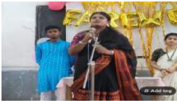
Farewell (Dept. of Education)