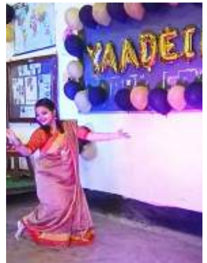
← Farewell (Dept. of History) →