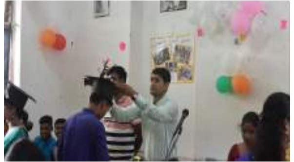
Farewell (Dept. of Education)