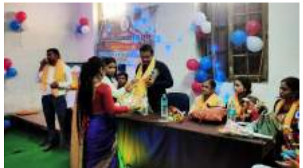
Fresher's (Dept. of Philosophy)