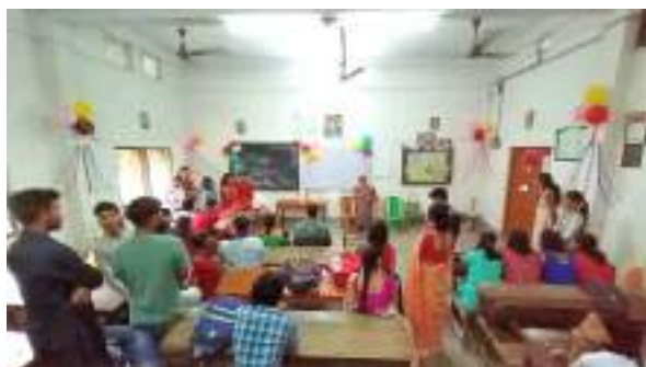
Dept. of English