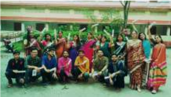
Farewell (Dept. of English)