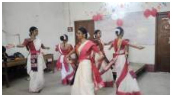
Dept. of Mathematics