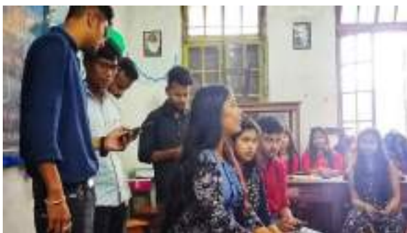
Farewell (Dept. of Botany)