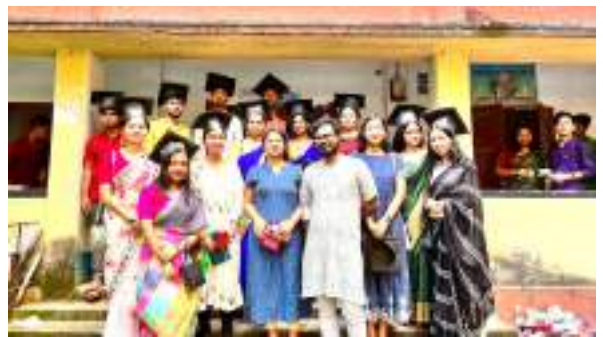
Farewell (Dept. of English)