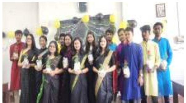
Fresher's (Dept. of Botany)