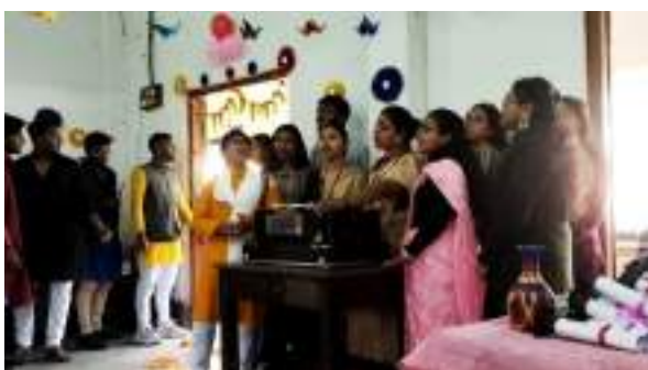
Farewell (Dept. of Bengali)