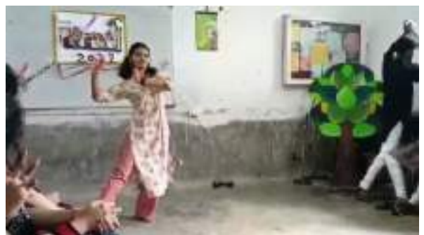
Farewell (Dept. of Sociology)