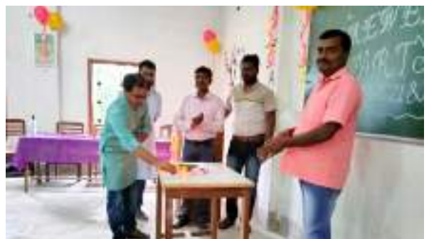
Farewell (Dept. of Geography)