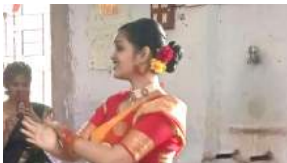
Dept. of Microbiology