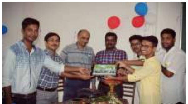
Farewell (Dept. of Geography)