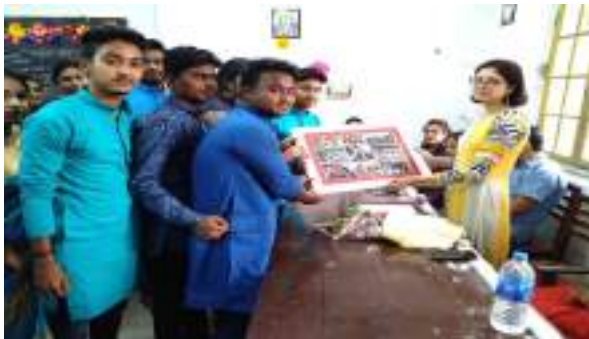
Farewell (Dept. of Botany)