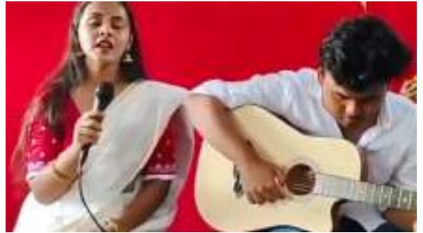
Fresher's (Dept. of Microbiology)