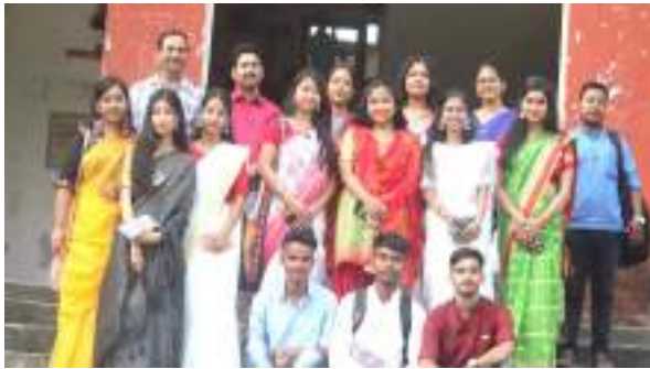
Dept. of Botany