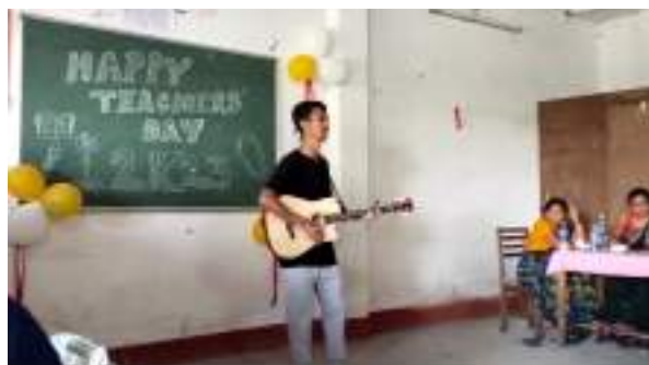
Dept. of Microbiology