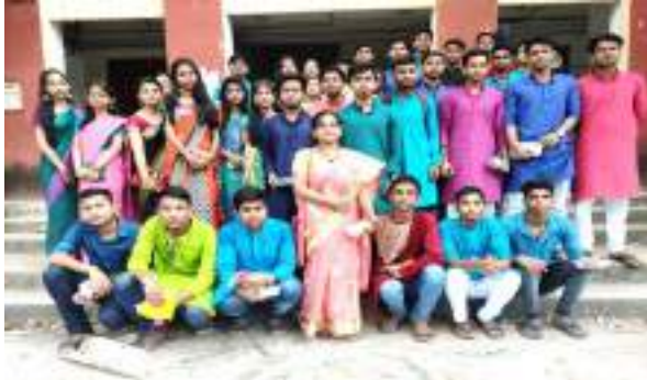
Fresher's (Dept. of Botany)