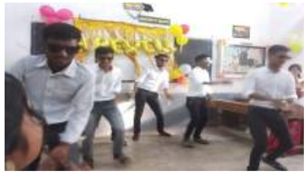
Farewell (Dept. of Education)