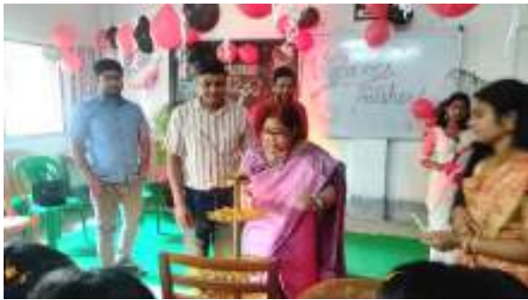
Fresher's (Dept. of English)