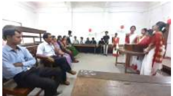
Dept. of Mathematics