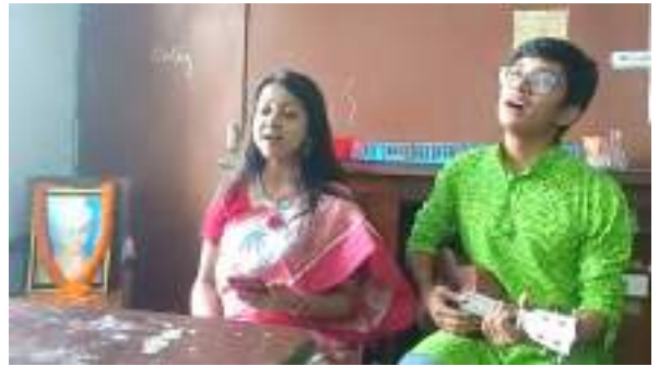
Dept. of Botany