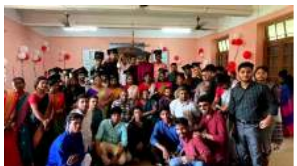
Farewell (Dept. of Pol. Sci.)