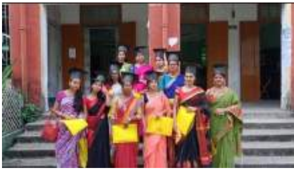
Farewell (Dept. of Bengali)