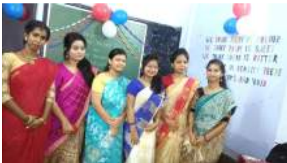
Fresher's (Dept. of Chemistry)