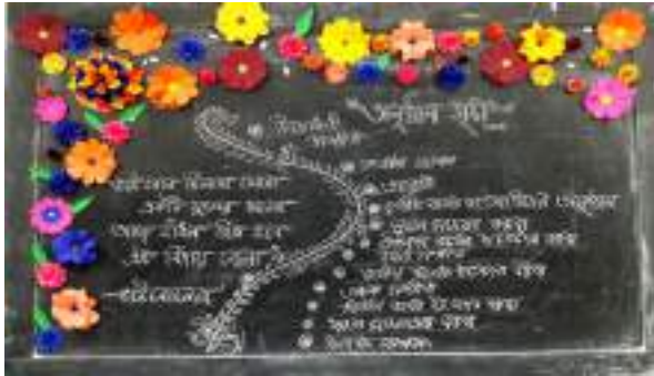
Farewell (Dept. of Botany)