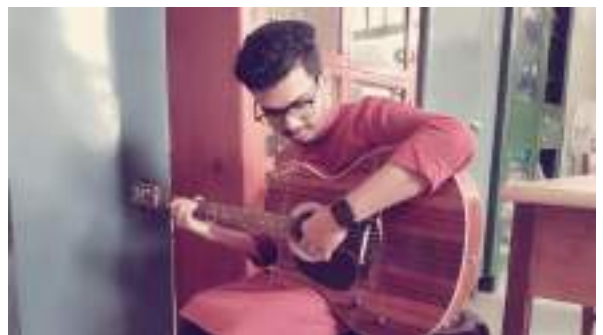
Fresher's (Dept. of Geography)