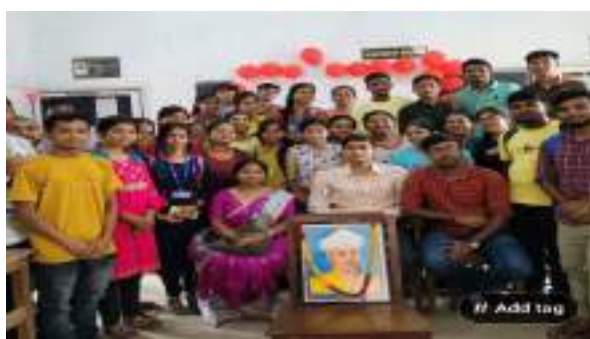
Dept. of Education