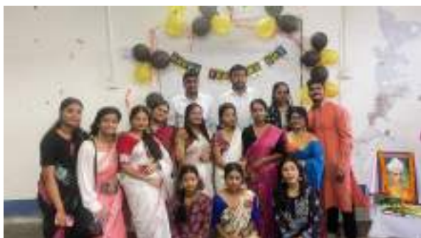
Dept. of Philosophy