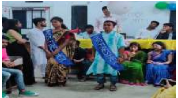
Fresher's (Dept. of Education)