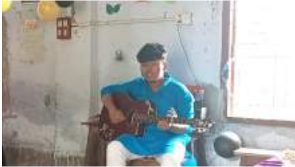
Farewell (Dept. of Microbiology)