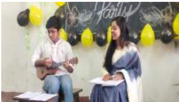
Fresher's (Dept. of Botany)