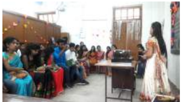
Farewell (Dept. of Botany)