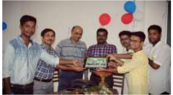
Farewell (Dept. of Geography)