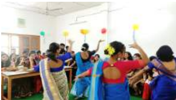
Dept. of Geography