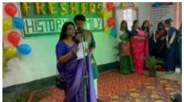
Fresher's (Dept. of History)