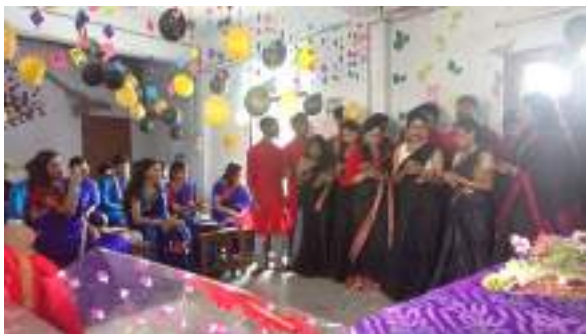
Fresher's (Dept. of Microbiology)