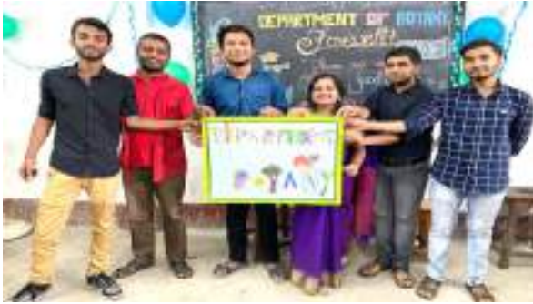
Farewell (Dept. of Botany)