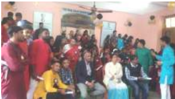
Fresher's (Dept. of Pol. Sci.)