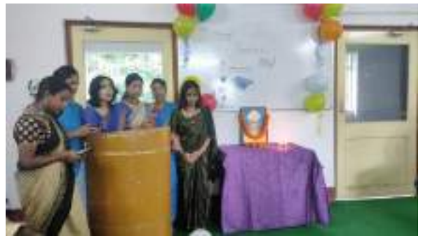
Dept. of Geography