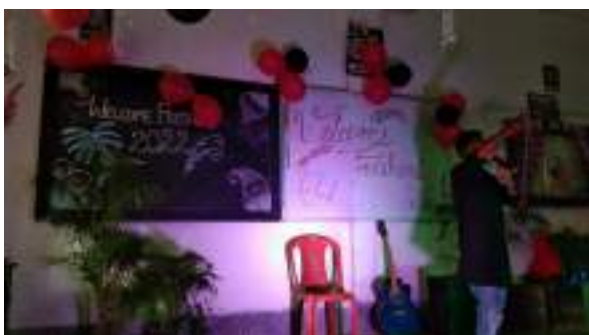
Fresher's (Dept. of English)