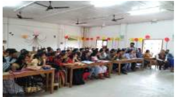
Farewell (Dept. of Geography)