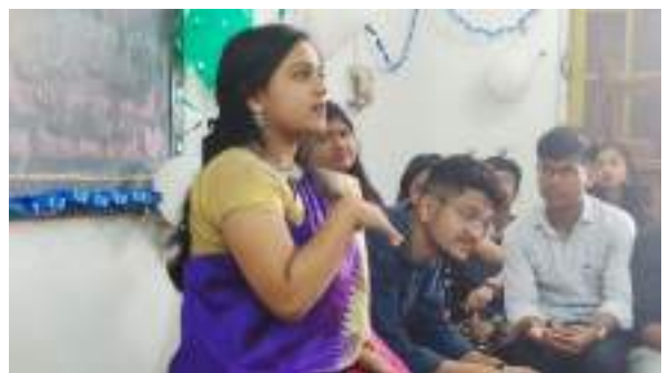
Farewell (Dept. of Botany)