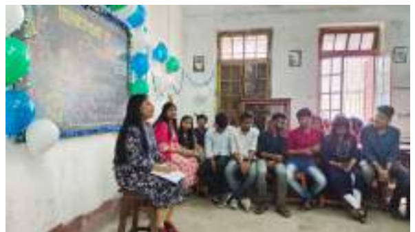
Farewell (Dept. of Botany)