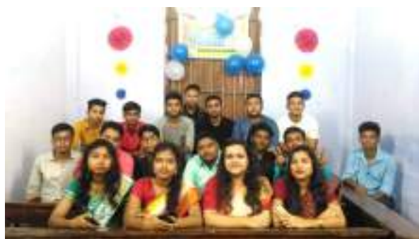
Dept. of Chemistry