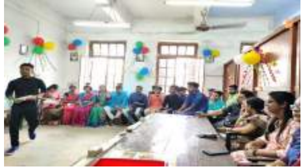
Fresher's (Dept. of Botany)